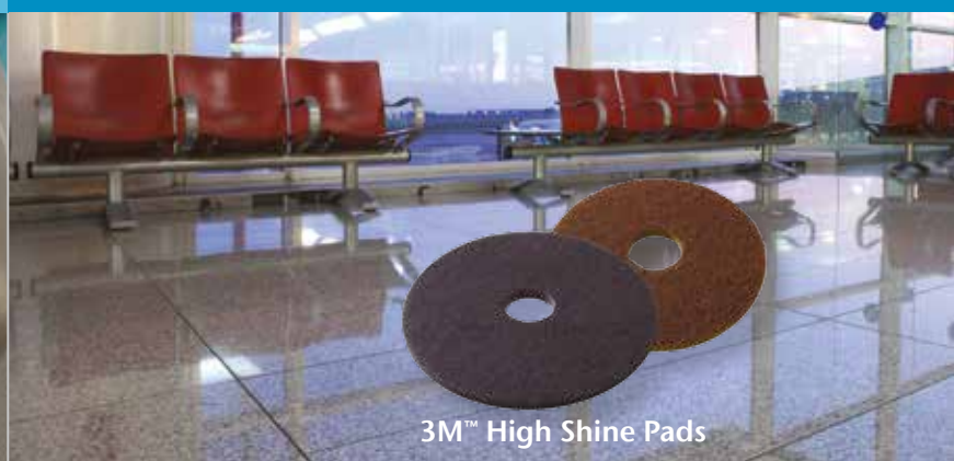
3M™ High Shine Pads