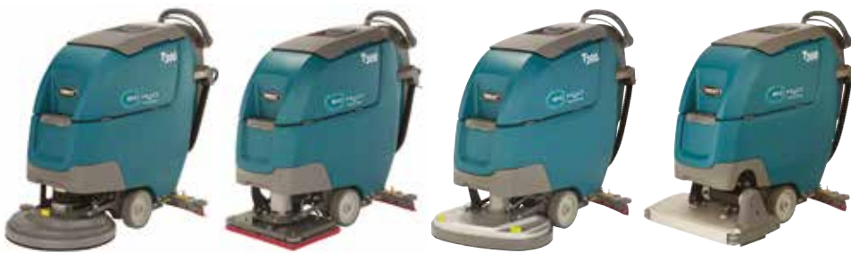
Single disk: 430 mm & 500 mm

The T300 scrubber-dryer provides multiple scrub-decks to fit your cleaning requirements and optimise cleaning performance.